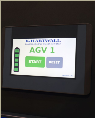
User-friendly HMI screen