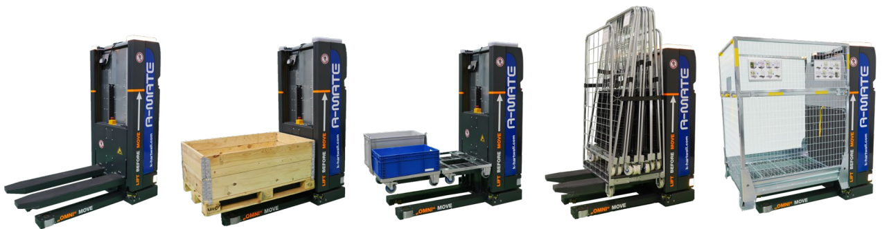
Handles all types of load carriers