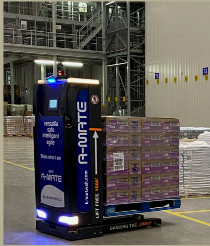
Omnidrive & Clear signalisation